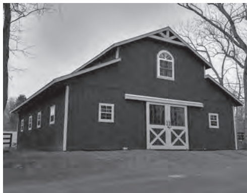
Custom Horse Barns