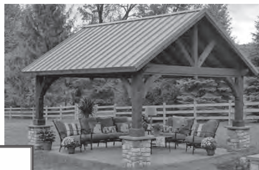
Pavilions and Pergolas