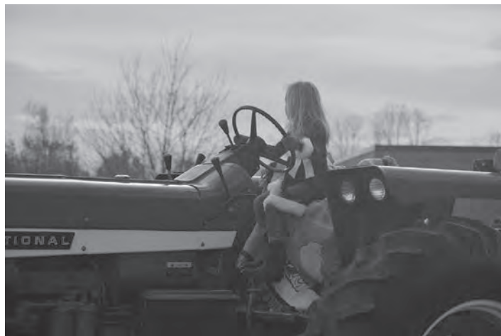
Greene County Parade of Lights

United Church of Christ 434-977-7229 Mt. Olivet United Church of Christ