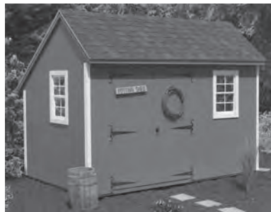
Custom Sheds to Meet Your Needs! Built on Site Available!